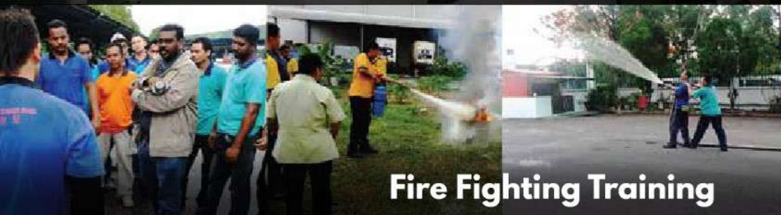
Fire Fighting Training