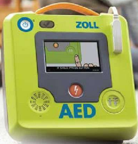
Zoll AED 3™ BLS.C

"WiFi-enabled Programme Management Onboard" You can reconfigure it, upgrade software to the latest Guidelines, and download event data files easily using the interactive touchscreen and onboard USB port.