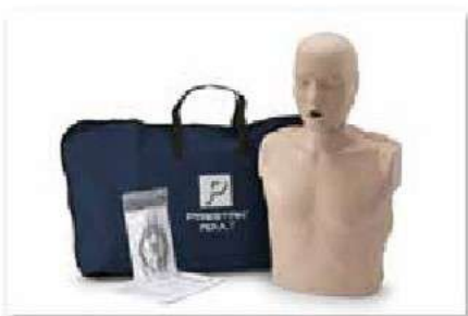
PRESTAN PROFESSIONAL ADULT CPR AED TRAINING MANIKIN ( WITH CPR MONITOR)