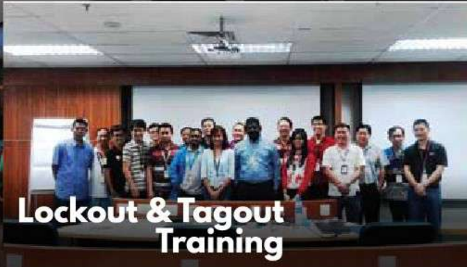
Lockout & Tagout Training