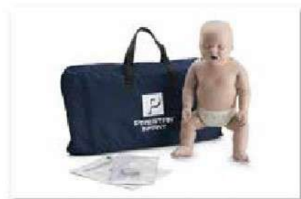
PRESTAN PROFESSIONAL INFANT CPR-AED TRAINING MANIKIN (WITH CPR MONITOR WITH AA BATTERIES)