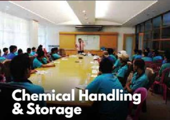
Chemical Handling & Storage