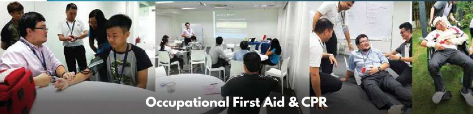
Occupational First Aid & CPR