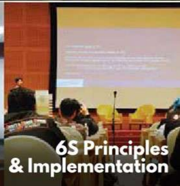
6S Principles & Implementation